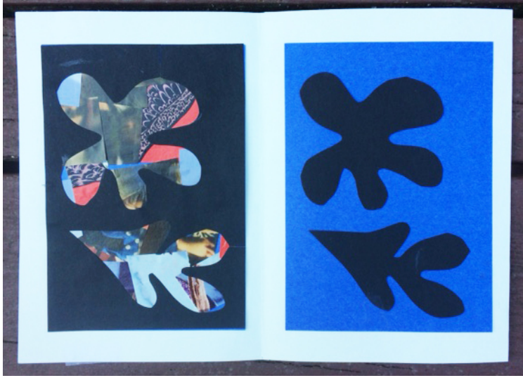
negative spaces- with collage background