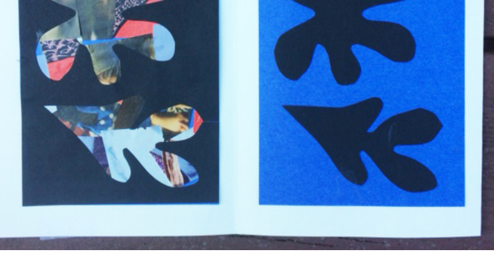
negative spaces- with collage background